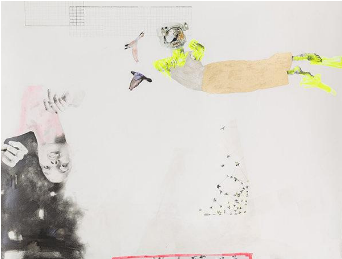
Untitled (flying and upside-down women)