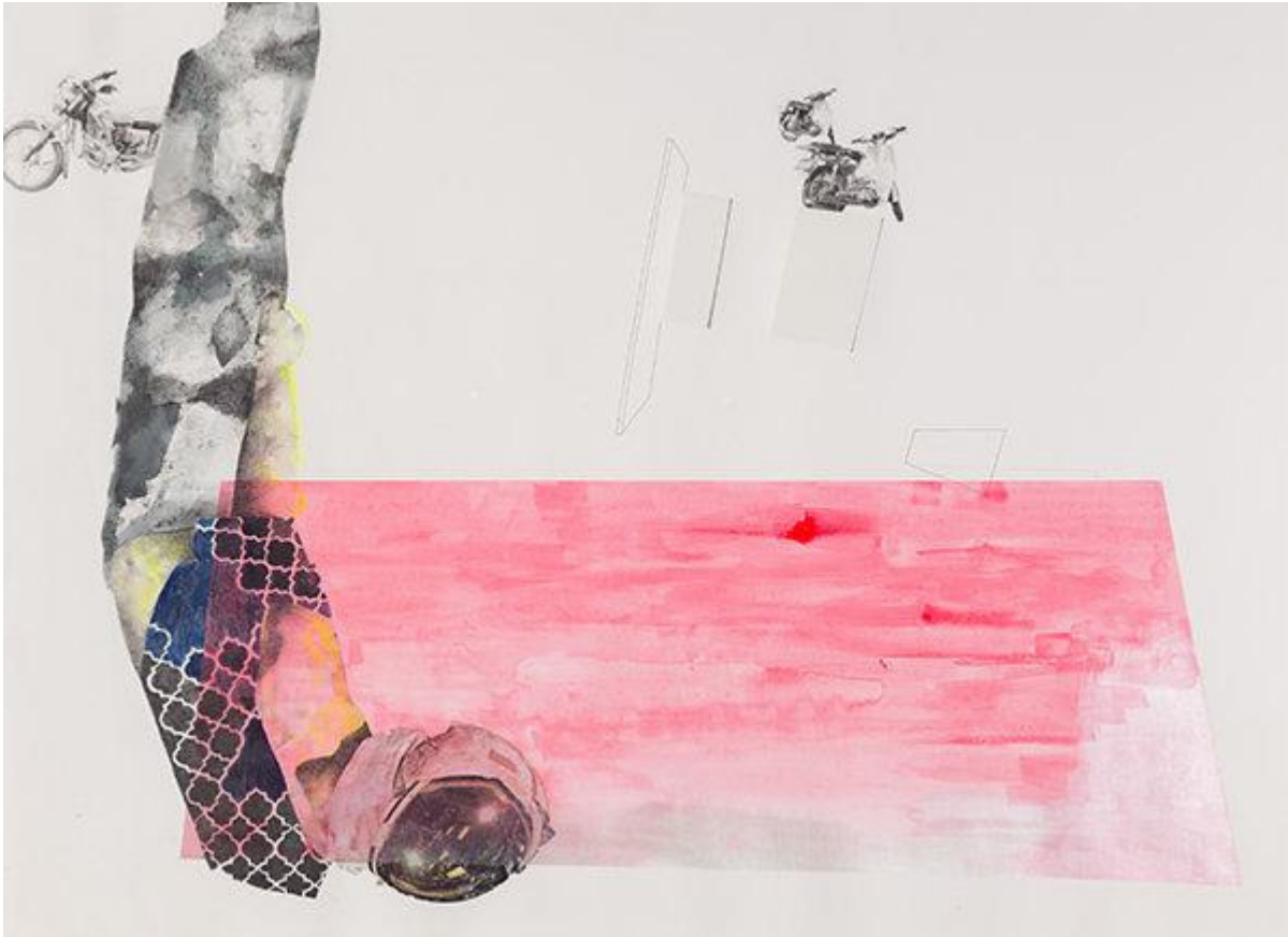
Untitled (diver and motorbike)

the paper, moving things around and creating a narrative. That's what gets me into studio every day; that's what keeps me on this paper for hours. That's the story I want to tell.'