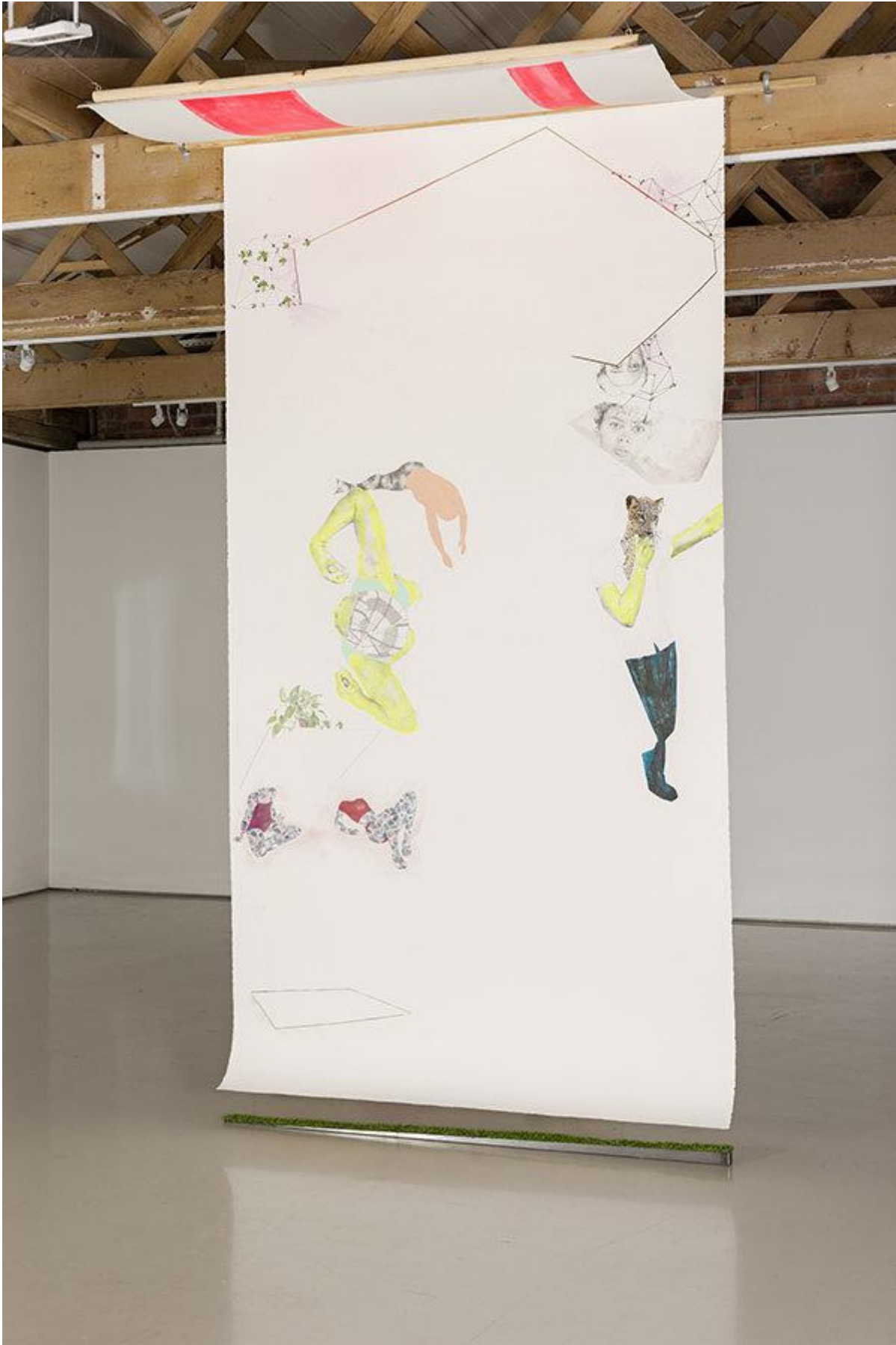
The Gap [and the beams of sub, special ordered on our behalf] 2017 Graphite, ink, photo transfer, metallic pigment, acrylic on paper 427 x 183 cm

There are even moonbeams we can unfold by Ruby Onyinyechi Amanze is showing at Cape Town's Goodman Gallery ( http://www.goodman-gallery.com/ ) until 16 June 2018.