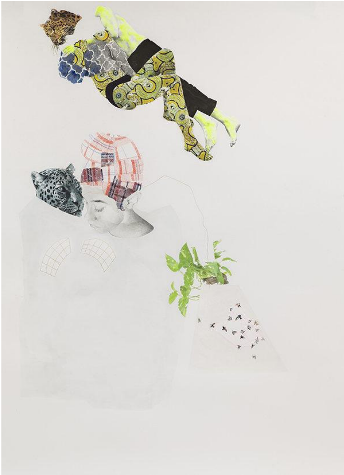
Untitled (birds and plants)