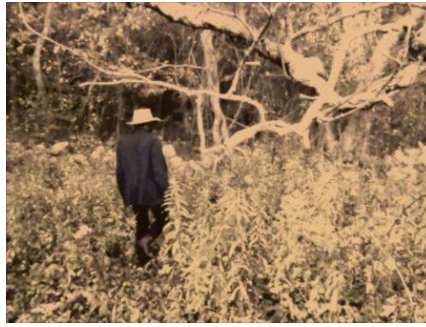
Samson Kambalu, Dancer in the Woods , 2018. Digital video, colour

looking for cheeky moments to capture – using himself as the star and strangers walking by as cinematographers. As he sees it, “Before I started making the films I was always a stranger in these cities because I would go to museums and learn about other people’s culture but when I started making films I realised everywhere I go becomes my own because I have made something out of it and there has been an exchange between me and the city itself.”