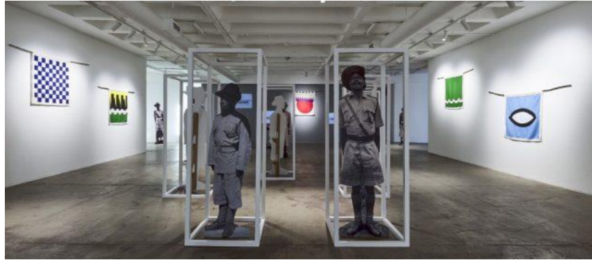
Samson Kambalu, Nyasaland Analysand . Installation view: Goodman Gallery, Johannesburg, 2019